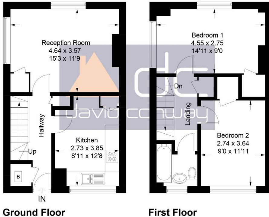
Illustration for identification purposes only, measurements are approximate, not to scale. David Conway © 2023 (ID1034307)

Approximate Gross Internal Area = 70.3 sq m / 757 sq ft